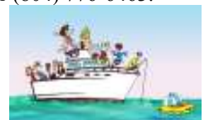
The Norview Crew

If you want to buy or sell, don't wait; contact Doug today at (804) 776-7447 or (804) 776-6463.